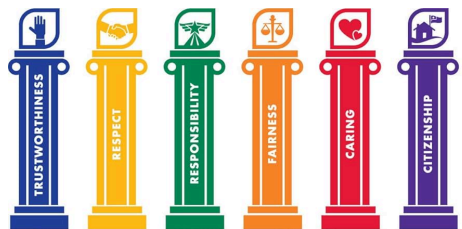
The Six Pillars of Character®